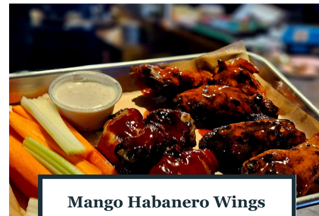
Mango Habanero Wings